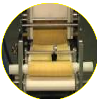
Automatically rolls down onto rolling pin