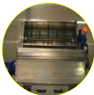
Extra Mixer ADSM320