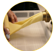
LASAGNA SHEET DIE (#60s)