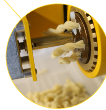
CUTTING KNIFE FOR SHORT PASTAS