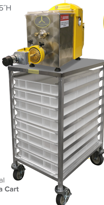
Optional APC8 Pasta Cart