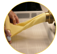
LASAGNA SHEET DIE (#60s)