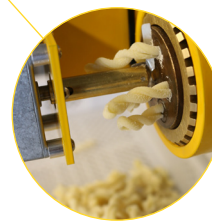
CUTTING KNIFE FOR SHORT PASTAS