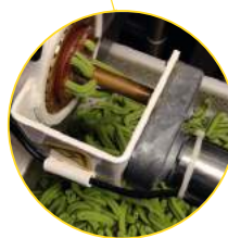
CUTTING KNIFE FOR SHORT PASTAS