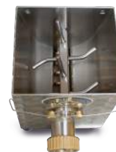
TOP VIEW INSIDE