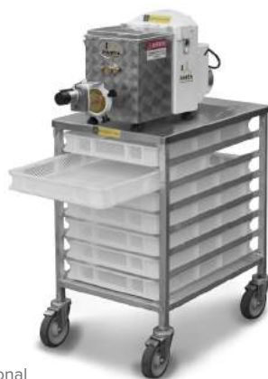
Optional APC9 Pasta Cart