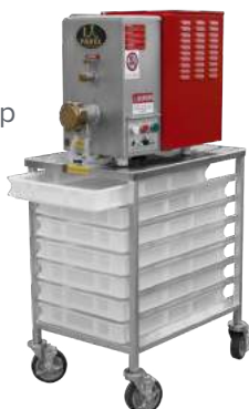
Optional APC-9 Pasta Cart