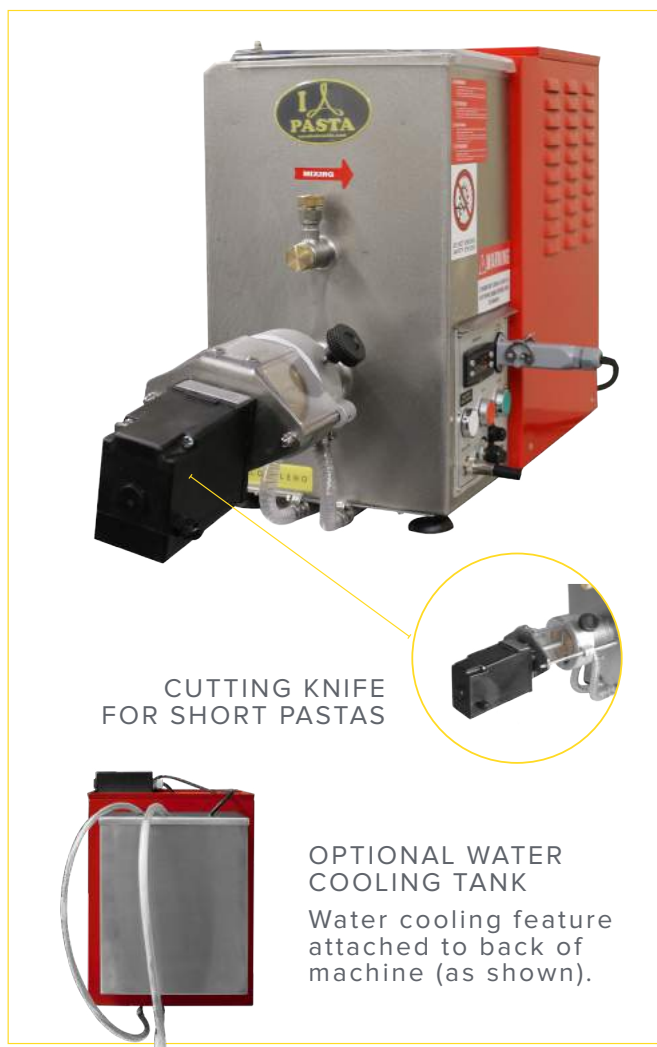
CUTTING KNIFE FOR SHORT PASTAS