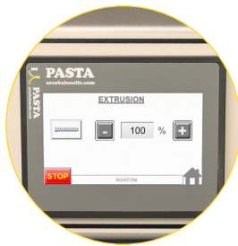
VARIABLE MIXING + EXTRUDING SPEEDS