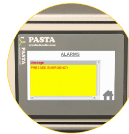
ALARMS INDICATING ERRORS