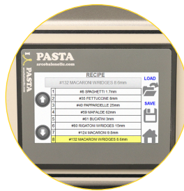
PRE-SET PASTA SHAPE RECIPES