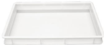
Optional Solid Pasta Tray