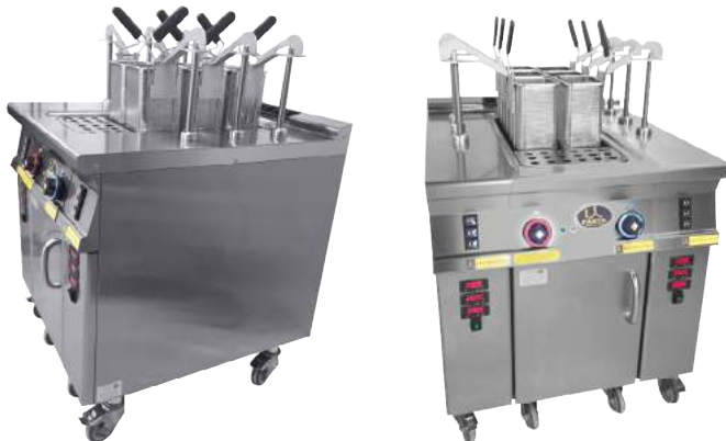
Pasta Cooker with 2 basket lifters right & left side