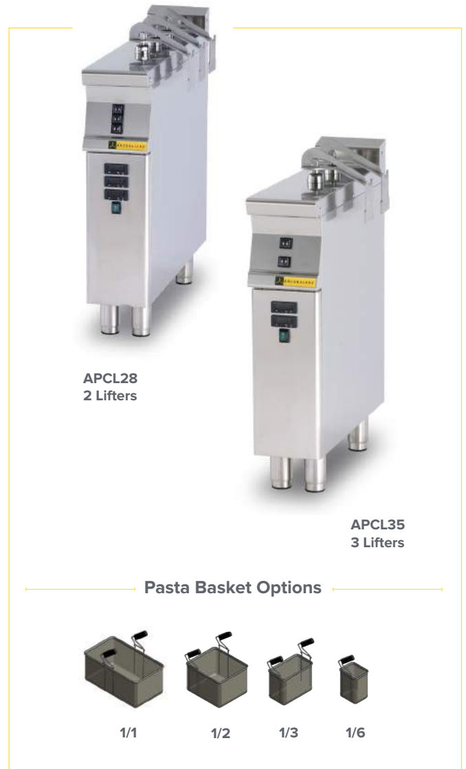
APCL28 2 Lifters