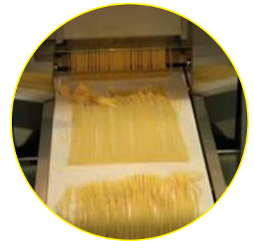
Optional Pasta Cutter (only available at time of order)