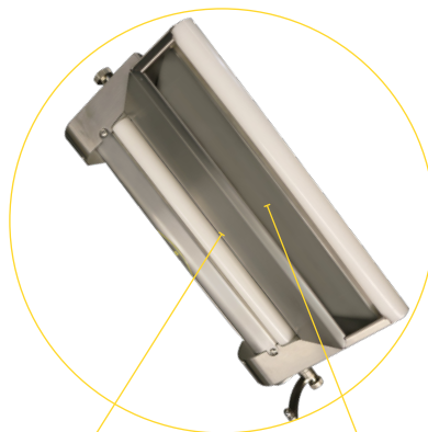
2 PASS SHEETER FRONT DOUGH FEEDER OPENING 3/8" BACK DOUGH FEEDER OPENING 1.5"