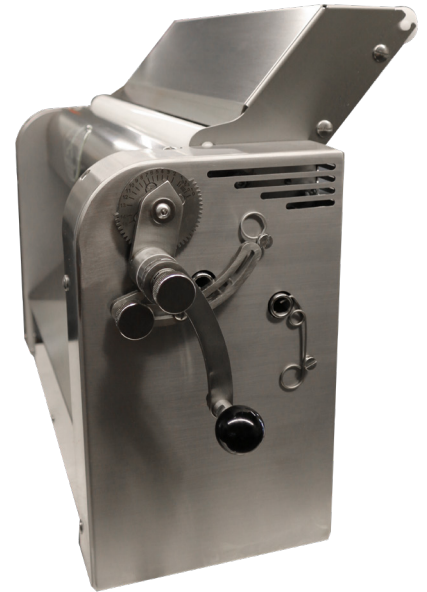
ERGONOMIC ULTRA COMPACT DESIGN