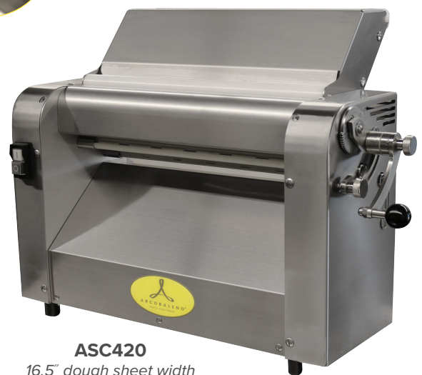
ASC420 16.5" dough sheet width