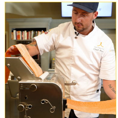
2 PASS SHEETER FRONT DOUGH FEEDER OPENING 3/8" BACK DOUGH FEEDER OPENING 1.5"