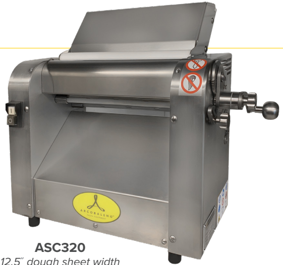
ASC320 12.5" dough sheet width