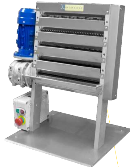
ATPC330 - 5 cuts

1, 1.5, 2, 2.5, 4, 5, 6, 6, 10, 12, 15 & 18mm SPAGHETTI TAGLIATELLI FETTUCCINE PAPPARDELLE