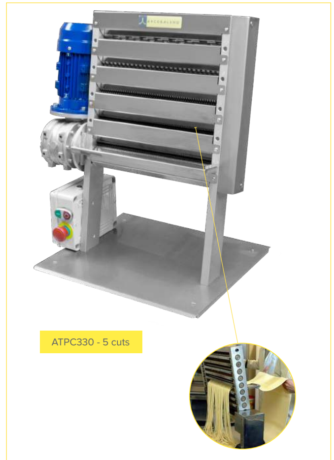
ATPC330 - 5 cuts