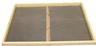
Pasta Drying Tray

Programmable recipes for different shapes and thicknesses