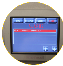
ALARMS INDICATING ERRORS