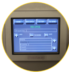
PRE-SET PASTA SHAPE RECIPES