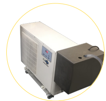
OPTIONAL WATER CHILLER MOBILE SYSTEM