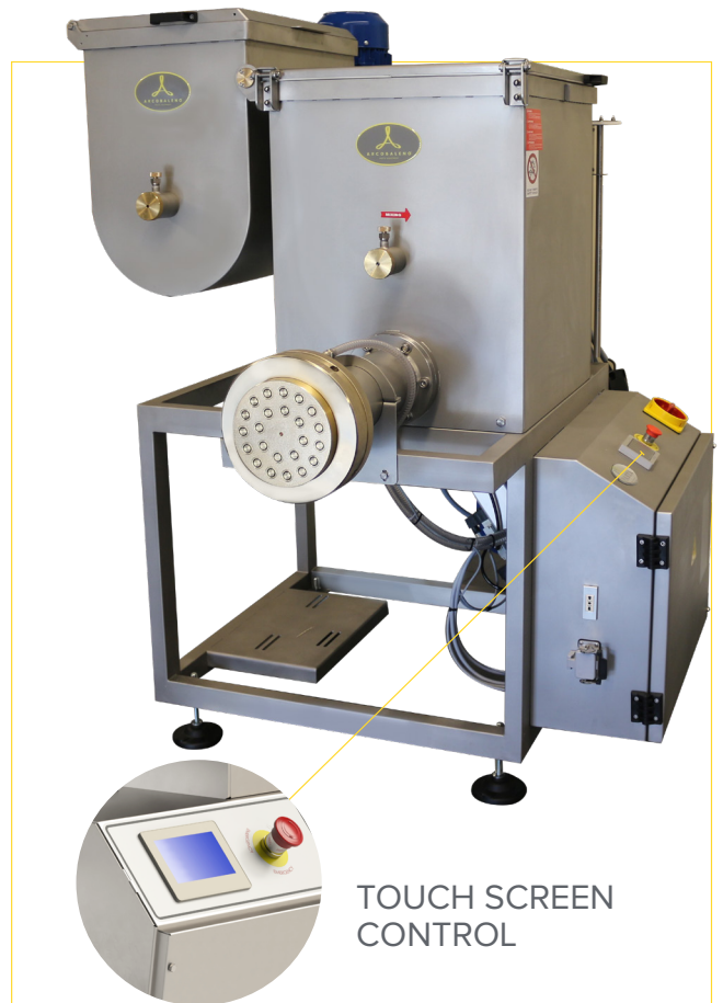
TOUCH SCREEN CONTROL