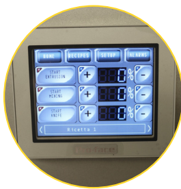
VARIABLE MIXING + EXTRUDING SPEEDS