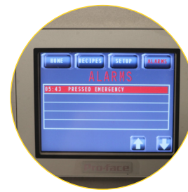
ALARMS INDICATING ERRORS