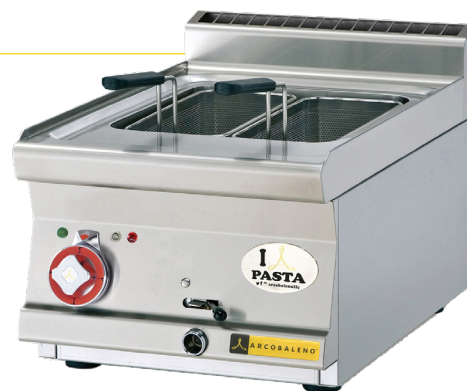
4.5 Gallon Tank APCT24 APCT25 "Elena"