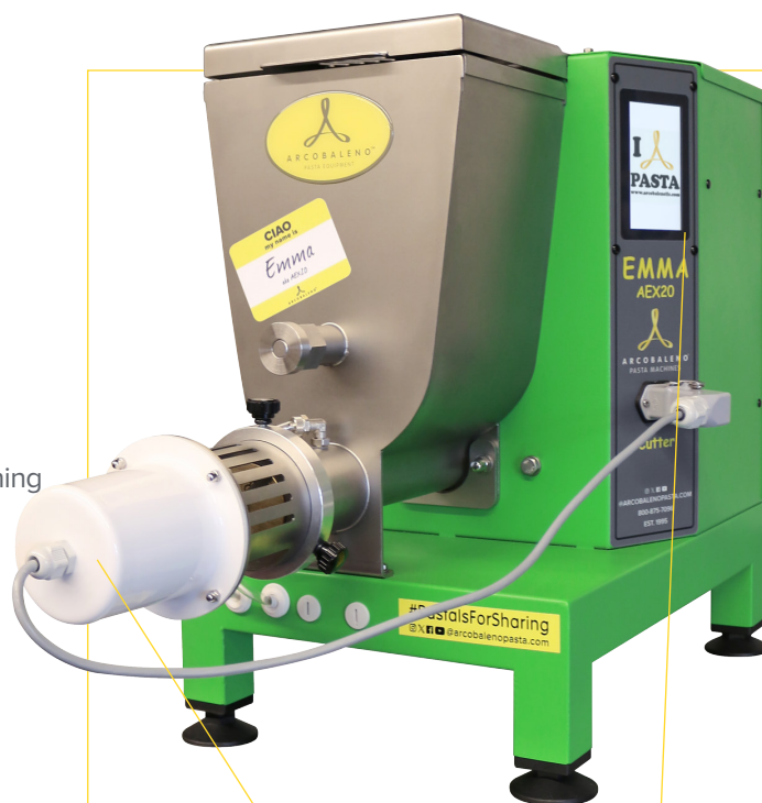
CUTTING KNIFE FOR SHORT PASTAS