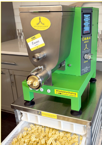
Same size dies as AEX18!

THAT'S 130 - 8OZ SERVINGS OF FRESH PASTA! THAT'S ONLY $0.31 PER 8OZ SERVING