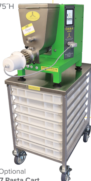
Optional APC7 Pasta Cart