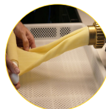
LASAGNA SHEET DIE (#60s) SAME SIZE AS AEX18