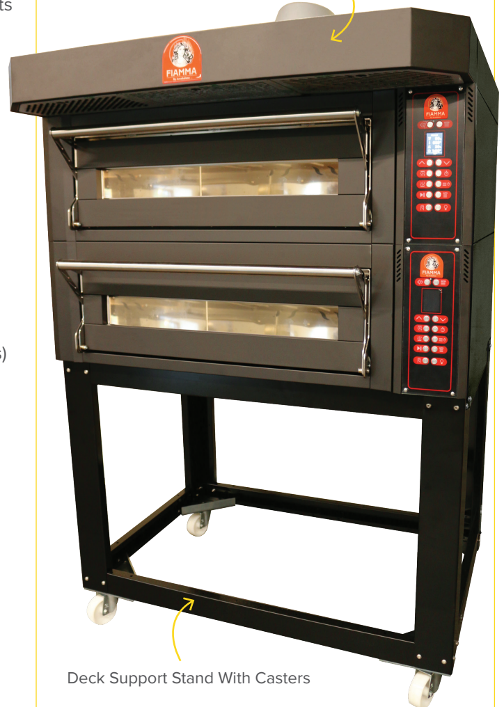
Deck Support Stand With Casters