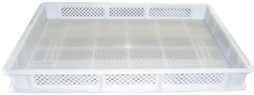
Perforated Pasta Tray