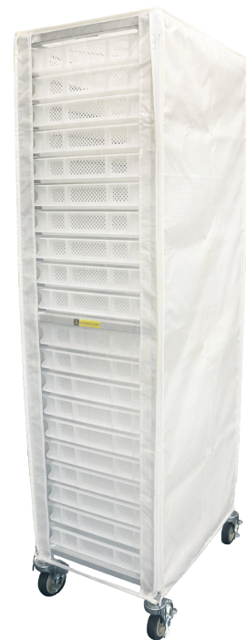
Optional APC20 Custom Cover